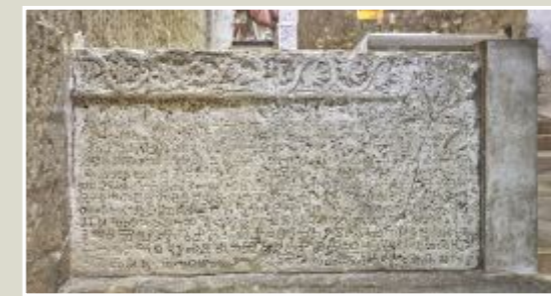
Baščanska ploča 1100 g. Sv. Lucija-Jurandvor info:+385 51 860 184 azjurandvor@yahoo.com www.azjurandvor.com

CITY PLAN / STADT PLAN / PIANA DELLA CITTÀ / PLÁN MĚSTA / PLAN MESTA